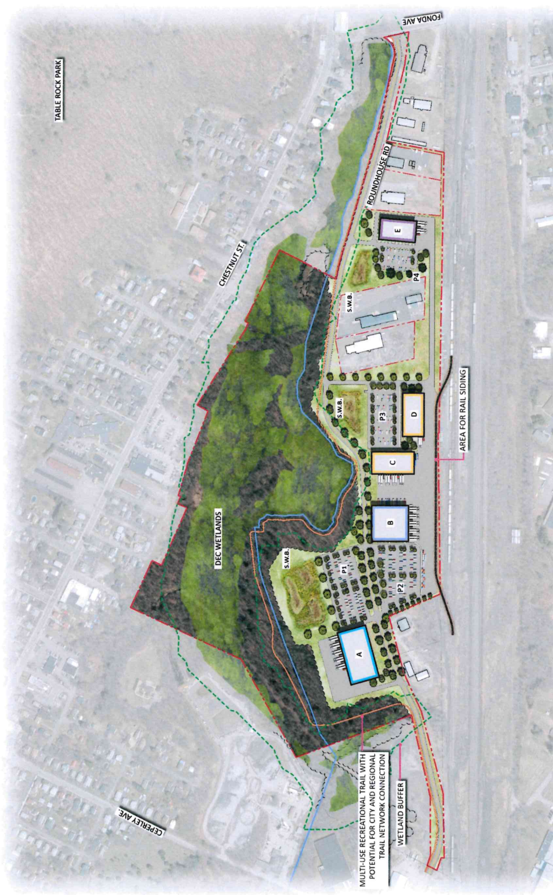
TABLE ROCK PARK