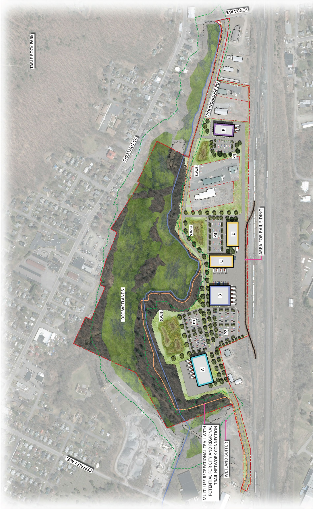
TABLE ROCK PARK